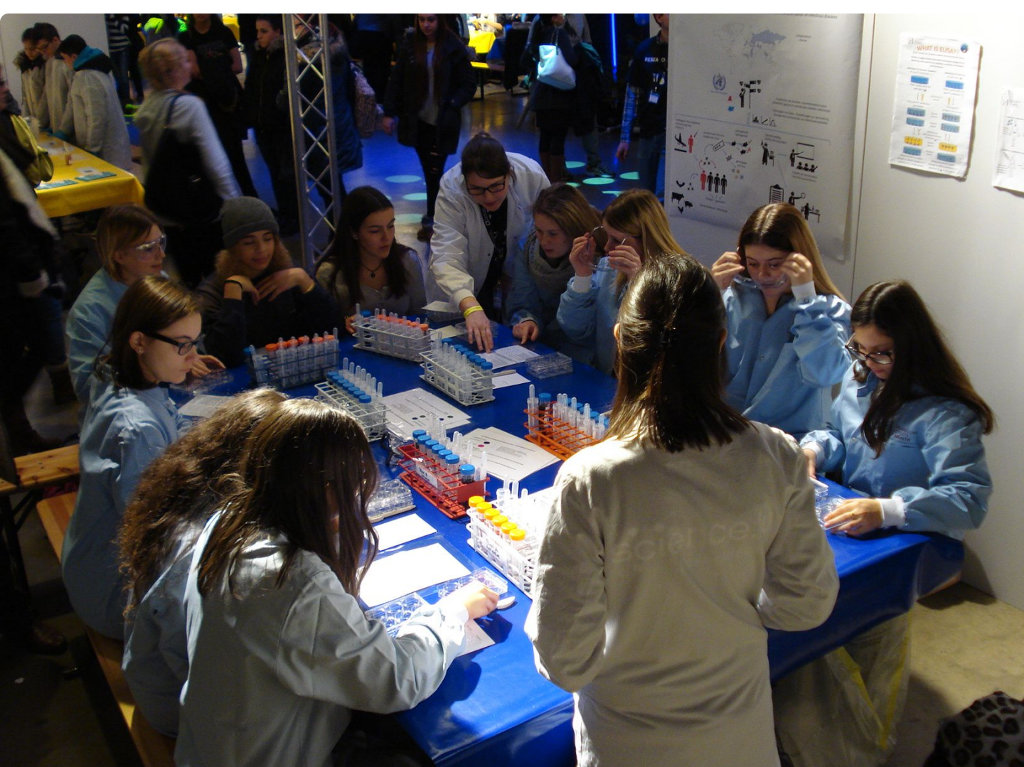
Workshop on "the little bugs that affect our lives"